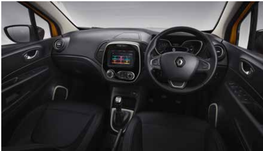
Ivory interior touch pack

Trim on centre console, speakers, air vents and gear gaiter