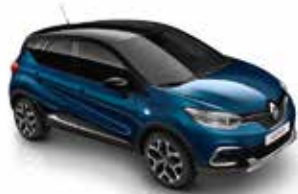
Ocean Blue Diamond Black roof (XWD)