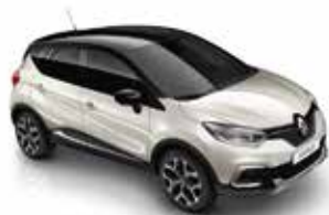
Ivory Diamond Black roof (XND)

It should be noted that printing limitations do not permit the subtle paintwork shades on these pages to be shown with absolute accuracy.