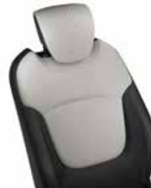
Fixed ivory upholstery