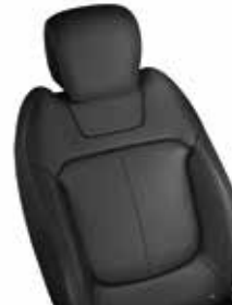
Fixed part leather, part synthetic leather part cloth upholstery