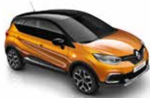
Desert Orange Diamond Black roof (XWB)