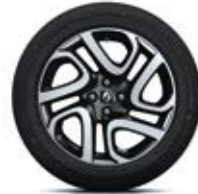
17" Explore alloy wheel with black inserts**