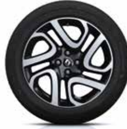
17" Explore alloy wheel with black inserts*