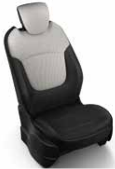
Fixed ivory upholstery