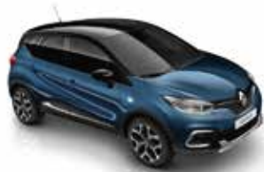
Boston Blue Diamond Black roof (XPE)