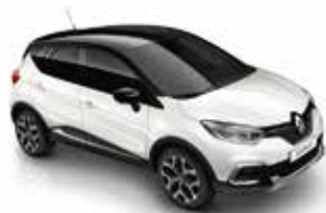
Arctic White Diamond Black roof (XUI)