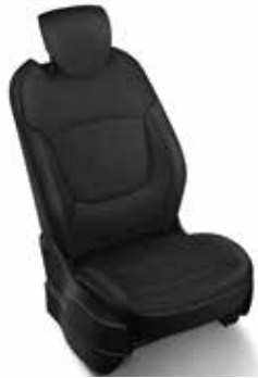
Fixed black upholstery