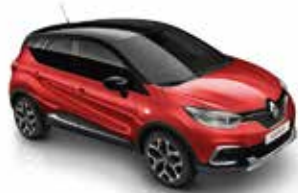
Flame Red Diamond Black roof (XPA)