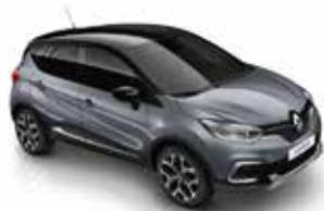
Oyster Grey Diamond Black roof (XNK)