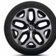
17" Emotion alloy wheel with black inserts