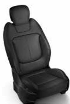
Fixed part leather, part synthetic leather, part cloth upholstery