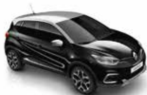
Diamond Black Mercury roof (XVT)