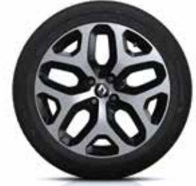
17" Emotion alloy wheels with black inserts