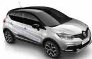
Mercury Diamond Black roof (XNM)